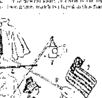
How to Outfit a Campaign Club...