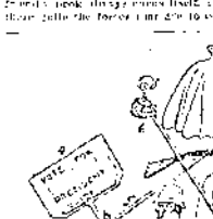
How to Outfit a Campaign Club...